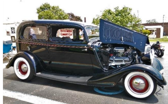
Derrick Kowalski's 1933 Ford Model A Sedan