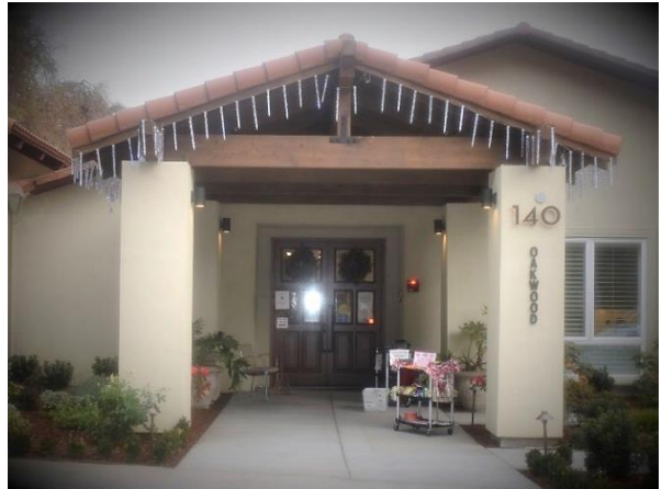
Oakwood, 140 Valparaiso Avenue, Atherton, CA