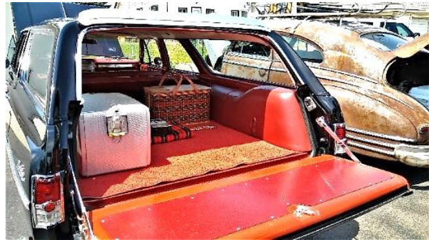
1964 Chevy Malibu with a Retro Picnic Set Up