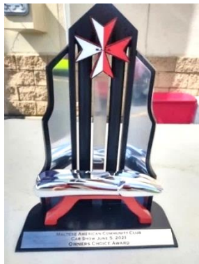
2021 Owners Choice Award