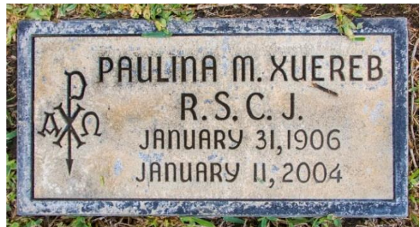
Gravestone, Oakwood Grounds, Atherton, CA