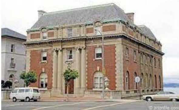
Convent of the Sacred Heart, 2222 Broadway Street, San Francisco