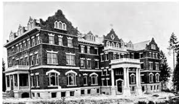
Forest Ridge Convent of the Sacred Heart, Seattle, WA

The Sisters of the Sacred Heart had opened a convent at 1013 15 th Avenue in Seattle in 1907. Two years later, they built a convent and day school at what became 1617 Interlaken Drive E. The school was named Forest Ridge owing to its location. It operated on this site until 1971 when the Sisters moved to larger quarters in Bellevue, a city just east of Seattle and separated by Lake Washington.