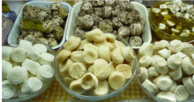
Varieties of Ġbejna

Ġbejna tal-bżar : Semi-hard, seasoned with fresh cracked pepper.