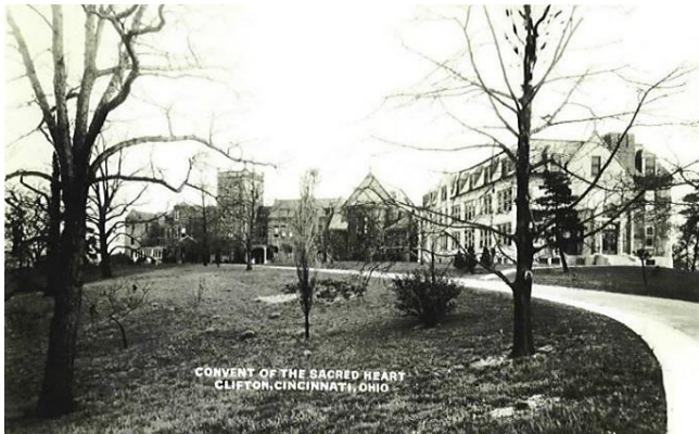
The Academy and Convent of the Sacred Heart, Clifton, Cincinnati, 1908