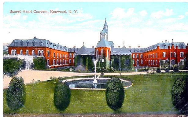
Sacred Heart Convent, Kenwood, Albany, New York