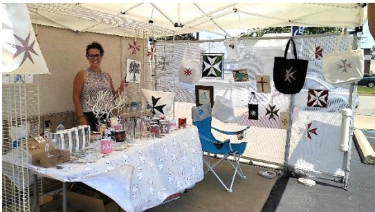
Graceful Stained Glass