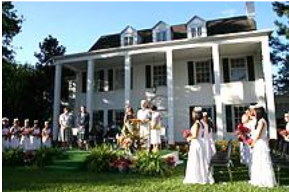
The Old "White House" of Duchesne Academy, Houston, Texas, 2008

This Academy was opened on September 8, 1960 and named in honour of St. Rose Philippine Duchesne who, with four other Sacred Heart nuns, was among the first members of the Society to come to the United States. Located at 10202 Memorial Drive in Houston, this all-girls private school goes from K3 through the 12 th grade.