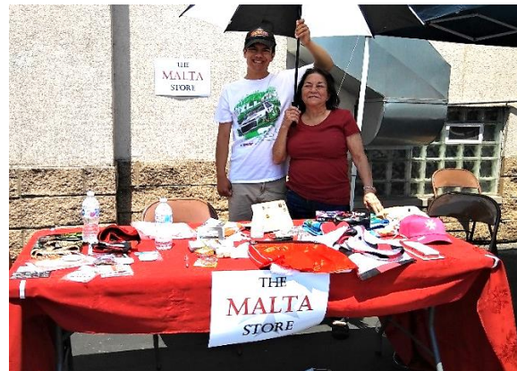
The Malta Store