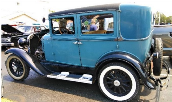
Joe Grima's 1931 Classic Willys Whippet Model 96a